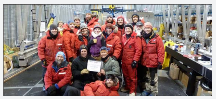
The WAIS Divide Ice Core project completed major coring operations on January 28, 2011, after five years of work, reaching a target depth of 3,331 meters making the WAIS Divide ice core the deepest U.S. ice core ever drilled and the second deepest ice core ever collected. Date taken: January 28, 2011

http://waisdivide.unh.edu/ProjectUpdates/ViewProject.shtml