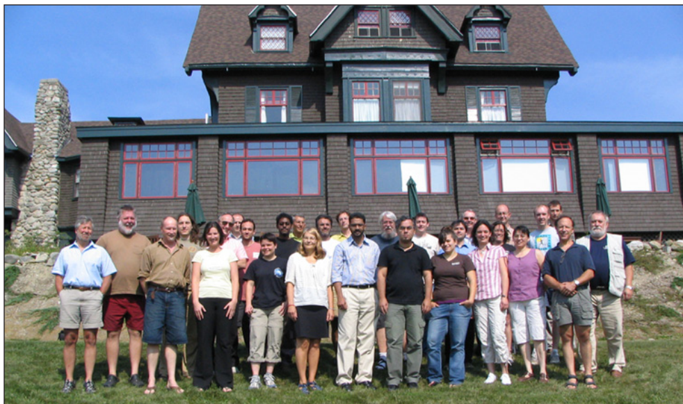
Participants at the ITASE Synthesis Workshop, held at the Manor Inn, Castine, Maine from 2-5 September 2008.

In addition to the interesting talks and discussions, we also enjoyed an afternoon of sailing in Penobscot Bay on the polar-class schooner Bowdoin, which has sailed many times to Greenland.