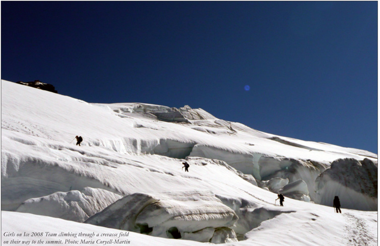
Girls on Ice 2008 Team climbing through a crevasse field on their way to the summit.