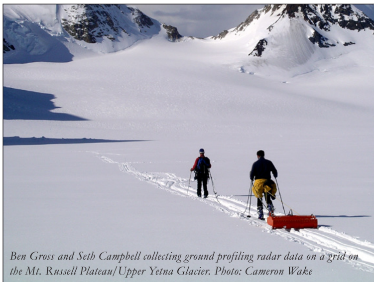
Ben Gross and Seth Campbell collecting ground profiling radar data on a grid on the Mt. Russell Plateau/Upper Yetna Glacier.

A weather station was installed at Kahiltna Base Camp (7200 feet) where most climbers begin their mountaineering expeditions. The weather information logged will inform the team on how various storms impact this part of DNP.